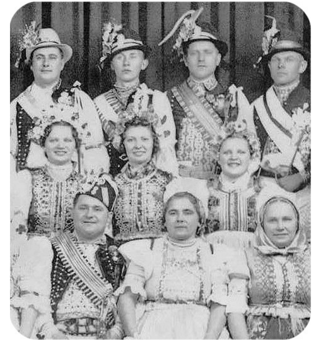
Carpatho-Rusyn wedding play, Passaic, 1930s

Carpatho-Rusyns, also known by various names such as Ruthenians, Carpatho-Russians, Lemkos, "Slavish", or even (inaccurately) as "Russians," are one of the major ethnic groups of the state of New Jersey.