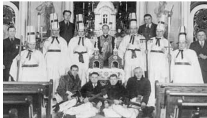
Traditional Rusyn Christmas carols, Trenton, 1940s

nity meetings as well as theatrical performances – mock weddings and plays reflecting the Rusyn experience in the homeland and in America.