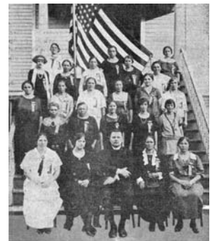
Rusyn women's church sisterhood, Singac, 1930s

Rusyns also established "brotherhoods" or burial societies (today known as fraternal organizations) to pay death benefits to the surviving family members of workers killed in industrial accidents. Most Rusyn fraternal groups got their start in the coal-mining districts of eastern Pa. but quickly gained a large membership in New Jersey. These included the Greek Catholic Union (GCU), the Russian Orthodox Catholic Mutual Aid Society, and the Russian Brotherhood Organization, all founded by and for Rusyns.