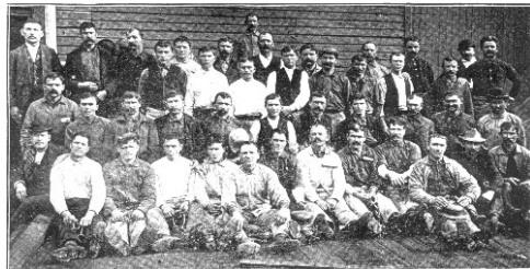
Immigrant Rusyn dock workers, Jersey City, early 1900s

In the years after World War II, many of these communities