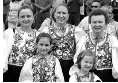
Recent Rusyn immigrants to New Jersey take pride in their traditions